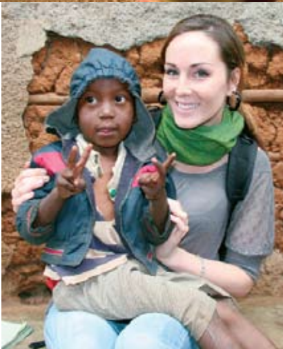
Amanda Lindhout with a child in Africa in August 2008, a week before she was kidnapped

With their heavily armed kidnappers hot in pursuit, the pair burst into the mosque just as the male congregants finished their midday prayer. “The men got up off their prayer mats and argued with us and our hostage takers,